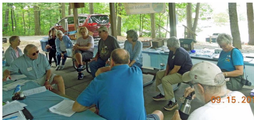
Bluebird enthusiasts share their nesting season experiences.