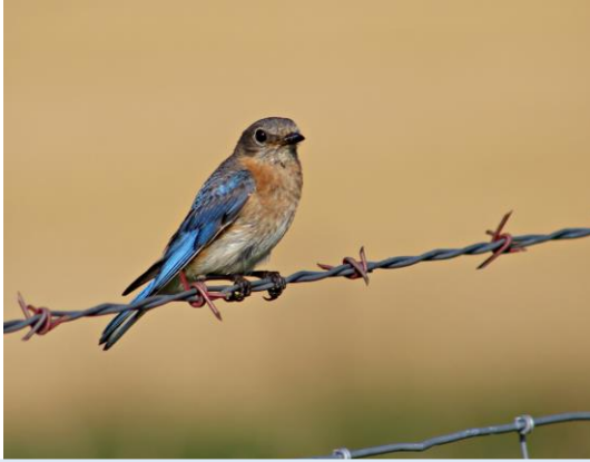
Female Eastern Bluebird.