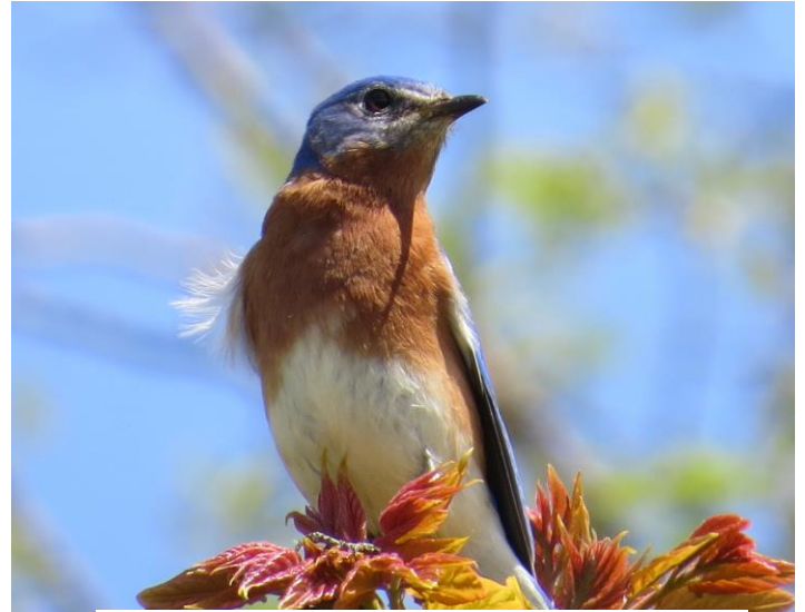
Male Eastern Bluebird in Washington County.