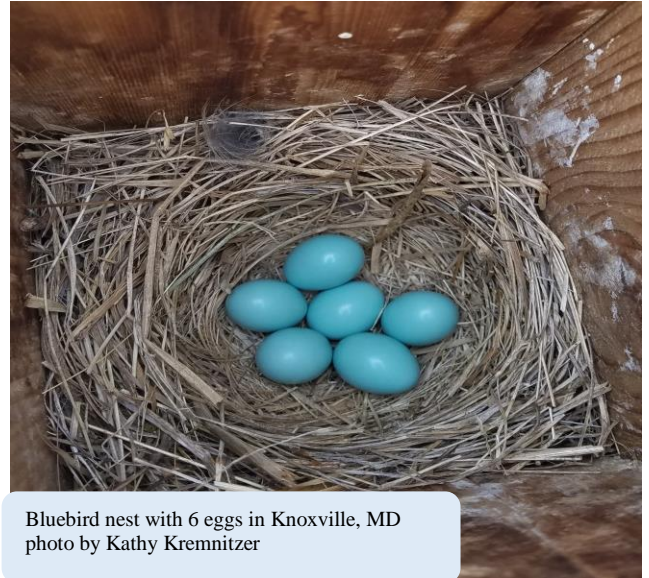
Bluebird nest with 6 eggs in Knoxville, MD

Good luck this nesting season. Keep monitoring and helping our bluebirds. Please check out our MBS website and Facebook as well as the North American Bluebird Society (NABS) website too. Lots of good, local, timely information.