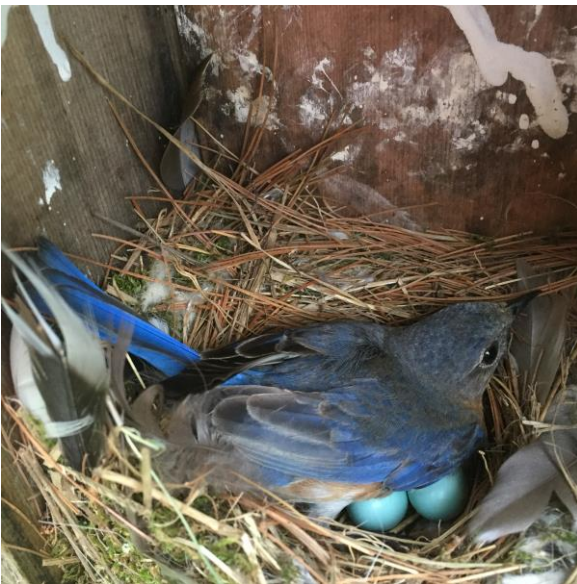
A devoted mother bluebird incubating her eggs