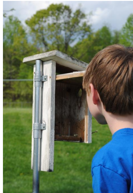
YSES Bluebird Club student checking a nestbox

Working in an elementary school, it was only natural for me to want to share my love of the outdoors and of bluebirds with my students. I began a bluebird club and the response was overwhelming! Unfortunately, in order to keep the number of participants manageable, it was limited to 4 th and 5 th graders. After researching ideal habitat, we sited and erected 6 nestboxes at our school. Club activities began in the fall and students attended weekly meetings to learn about bluebirds, their nesting habits, monitoring procedures, etc. Just before nesting season, students were divided into teams and were