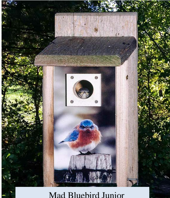
Mad Bluebird Junior