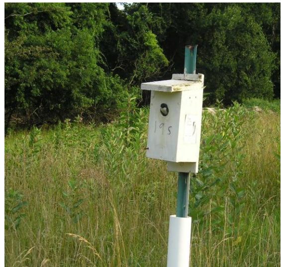
A tree swallow peeks out from the entrance hole of the Duncan style box.

As reflected by the numbers of fledglings, the bluebirds prefer the Peterson Model 69% as compared to 30% for the Duncan Model. The assumption is that the inside of the Peterson Model resembles a tree better than the Duncan Model. Mr. Laing has painted the boxes twice over 10 seasons and plans to replace the Duncan Model with the Peterson Model as the boxes age and need to be replaced. Eagle Scout projects are meant to last and Eric Laing's project has lasted for over a decade and has resulted in an increase in the Eastern Bluebird population in Montgomery County. Some of the neighbors around Needwood have commented on the increased number of bluebird sightings in their yards.