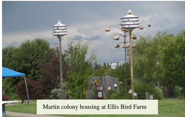
Martin colony housing at Ellis Bird Farm

in the beautiful gardens to share bluebird strategies and monitoring experiences. Some attended the round-robin tours to various farm sites while others, such as myself, chose to simply enjoy watching the birds while getting to know fellow bluebird lovers.